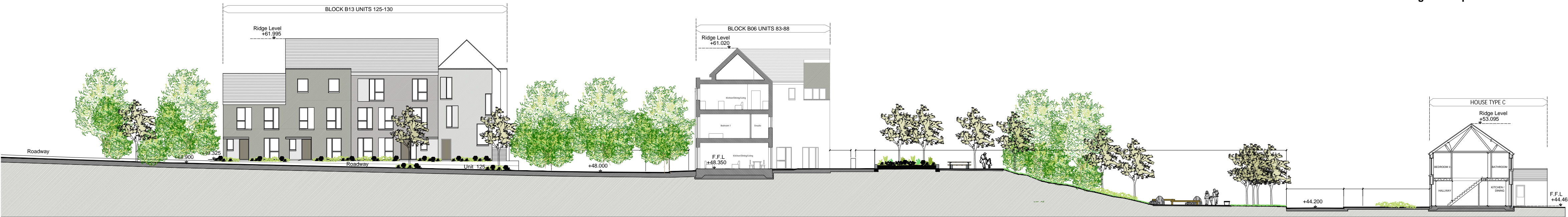
SITE SECTION C-C